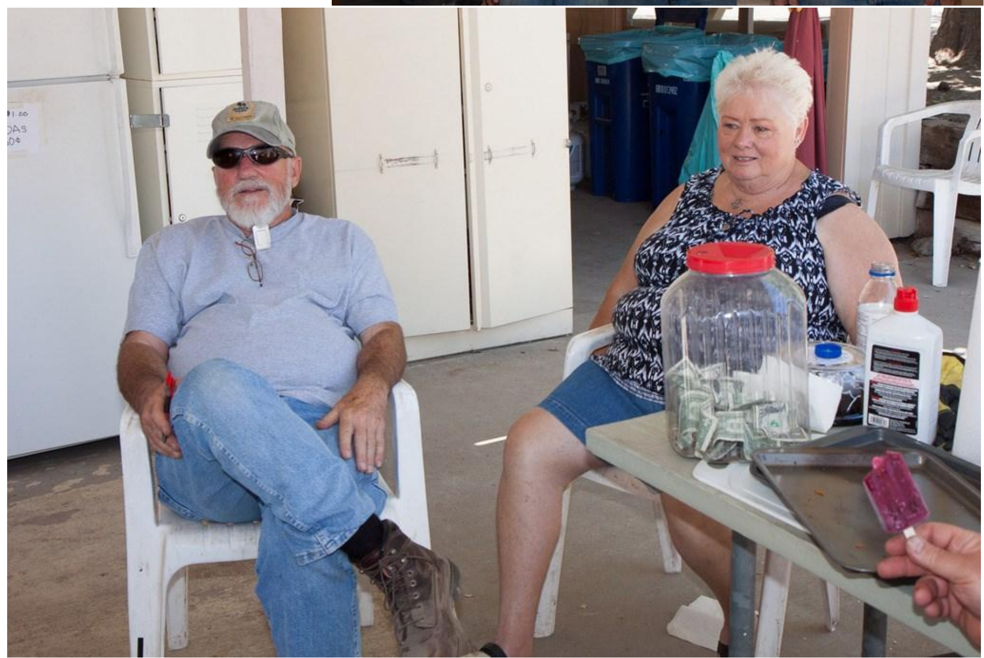
Even the Match director needs time to relax!