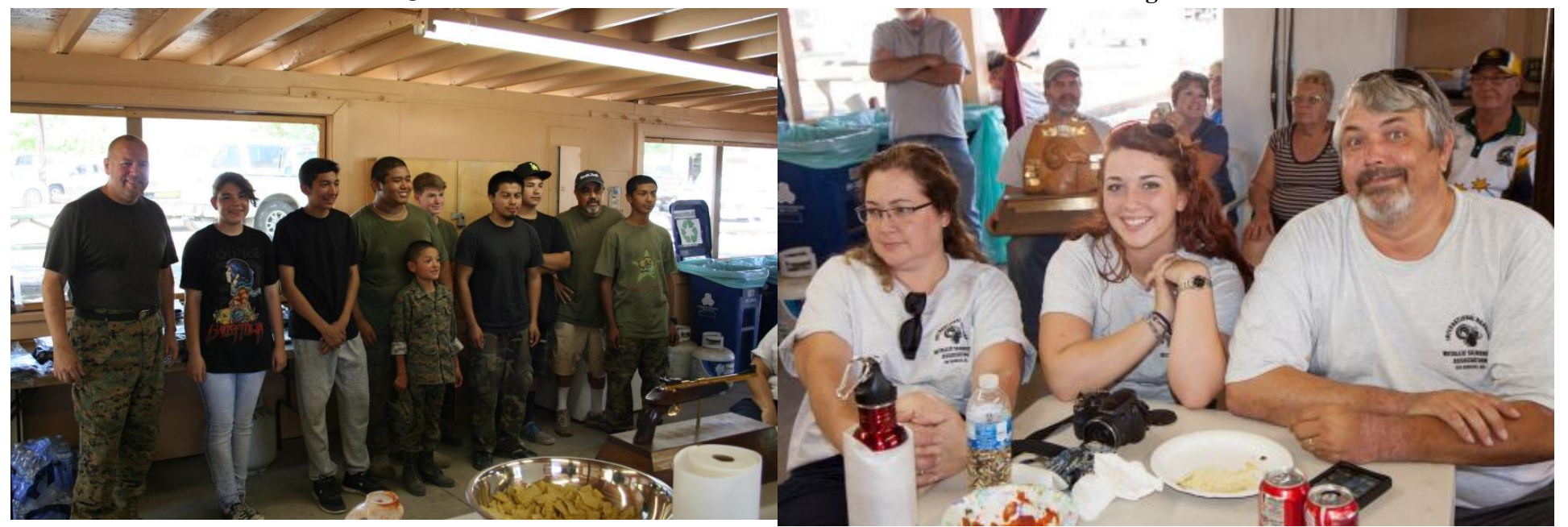
Our Target setters! The Los Angeles young Marines