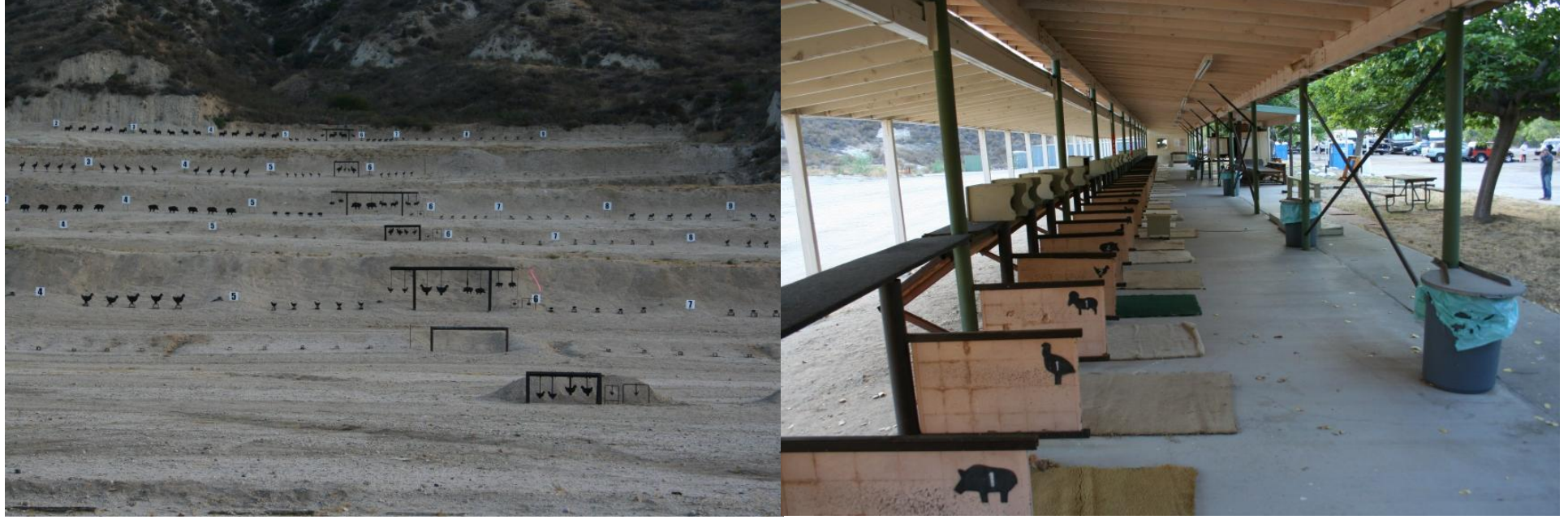
The LASC Range