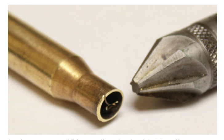
2. The next step will be to adjust the 6.5-06 sizing die to partially size part of the length of the case neck. This may require some fine adjustment. You will want to size only a small portion of the neck and then try chambering in your firearm to

1. I first start off with new 270 cases. The chamber of my 6.5-06 will not accept the full length 270 case which measures 2.540" in length. I will trim the cases back to a length of 2.497". I then chamfer and de-burr.