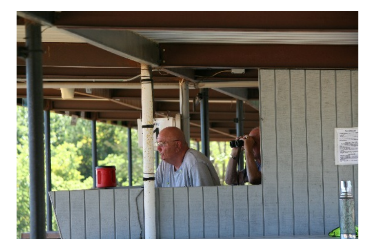
Range Masters hard at work