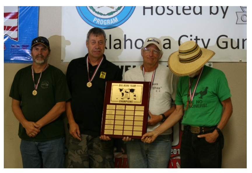
USA, Winner of the team award