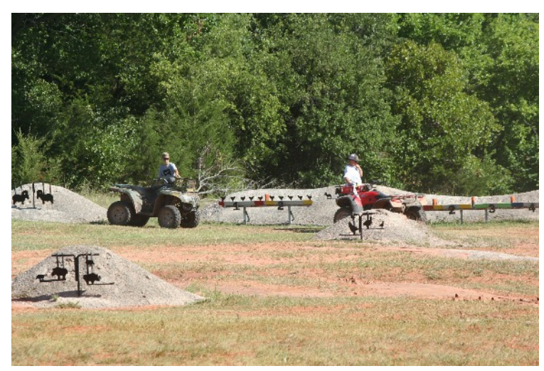
Cannot forget the target setters!