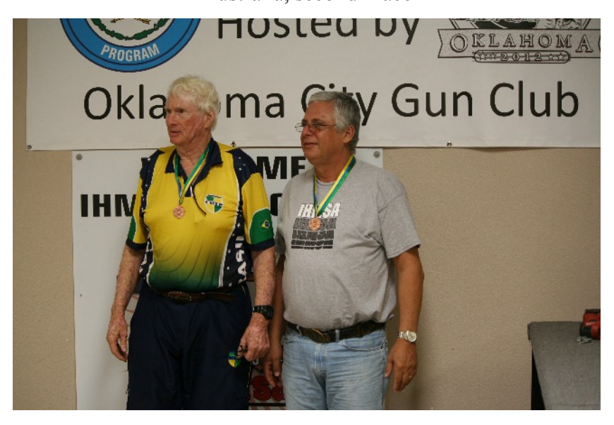
Brazil, Third Place