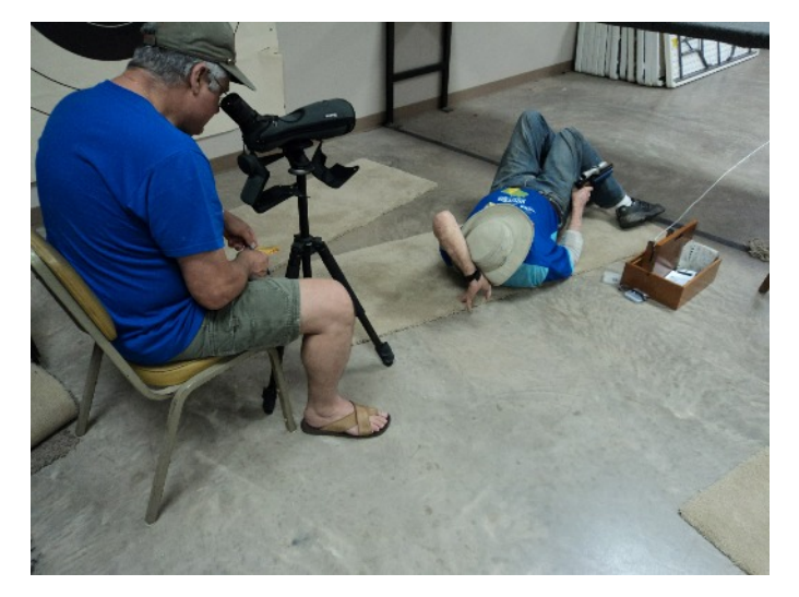
Air Pistol Match