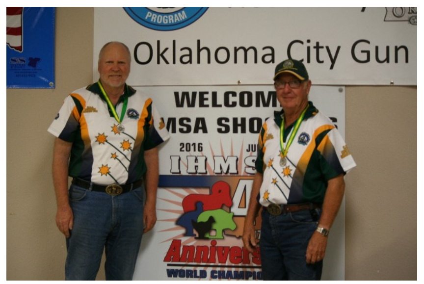
Australia, second Place