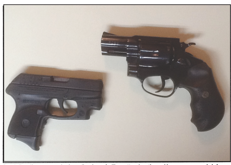
Bordello offers a practical application of silhouette shooting with your personal defense firearm.