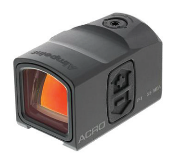
The NEW ACRO sight