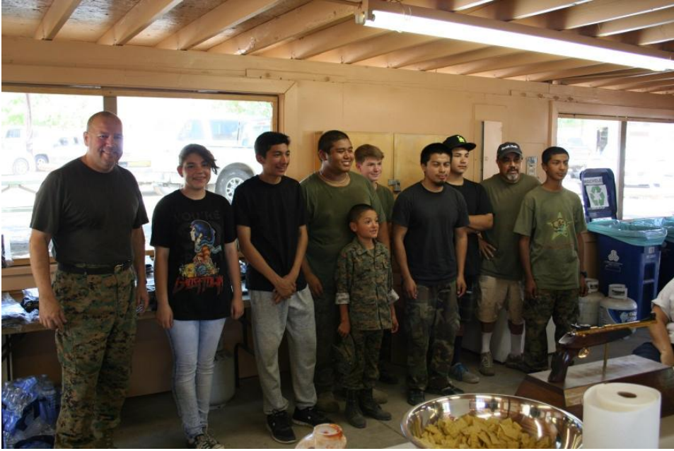
Our Target setters! The Los Angeles young Marines