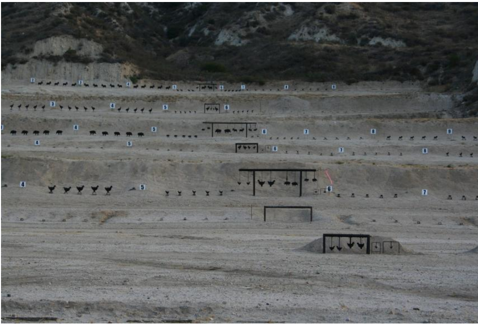
The LASC Range