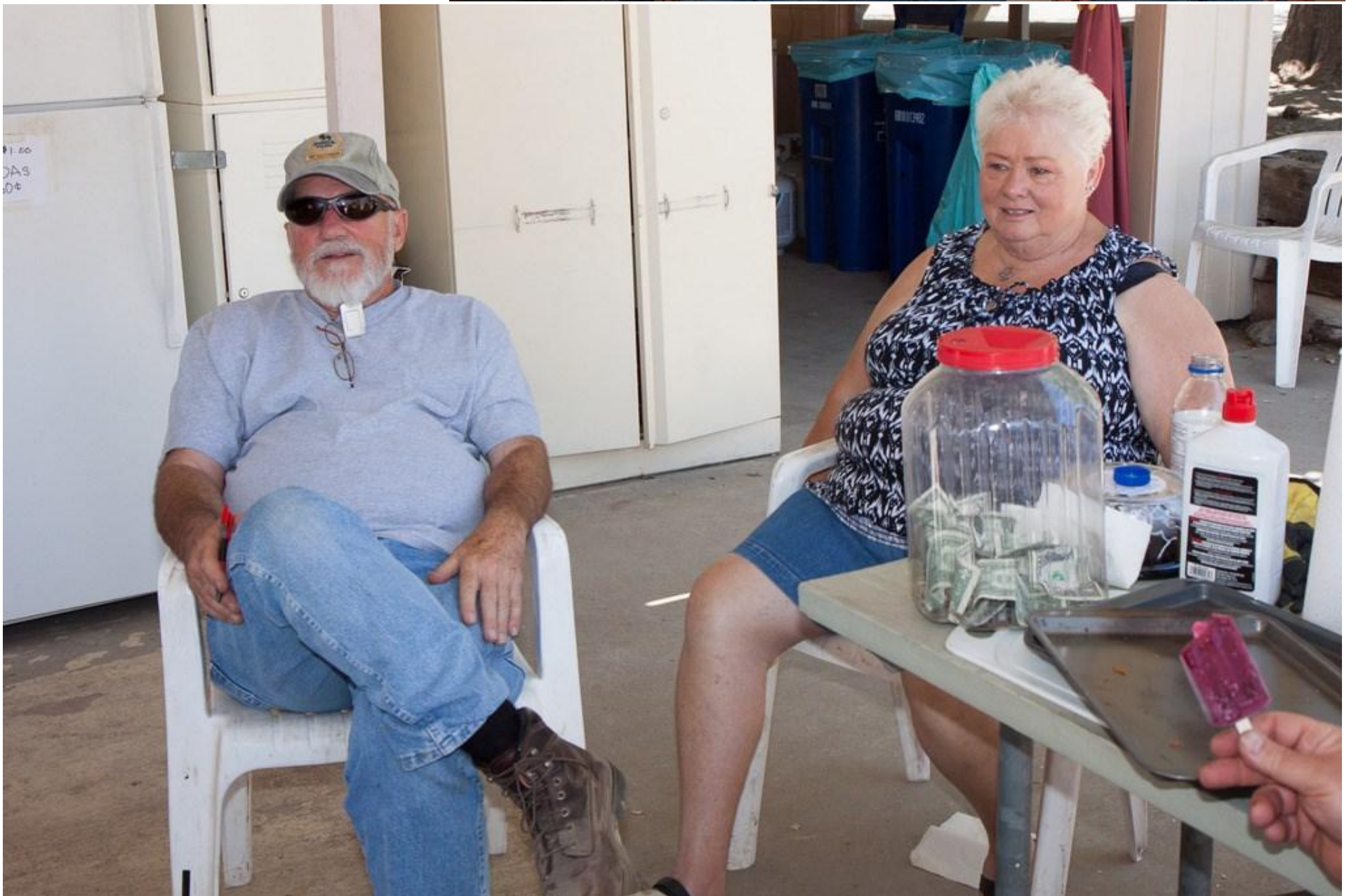
Even the Match director needs time to relax!