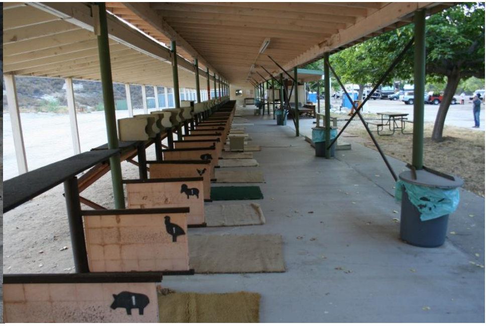
The firing line