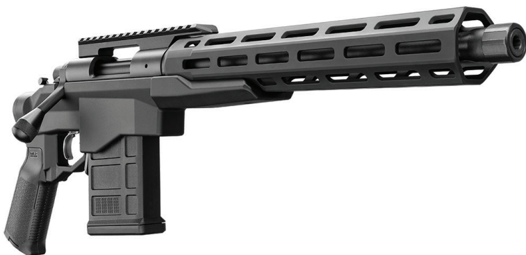
Remington 700 CP (Chassis Pistol)