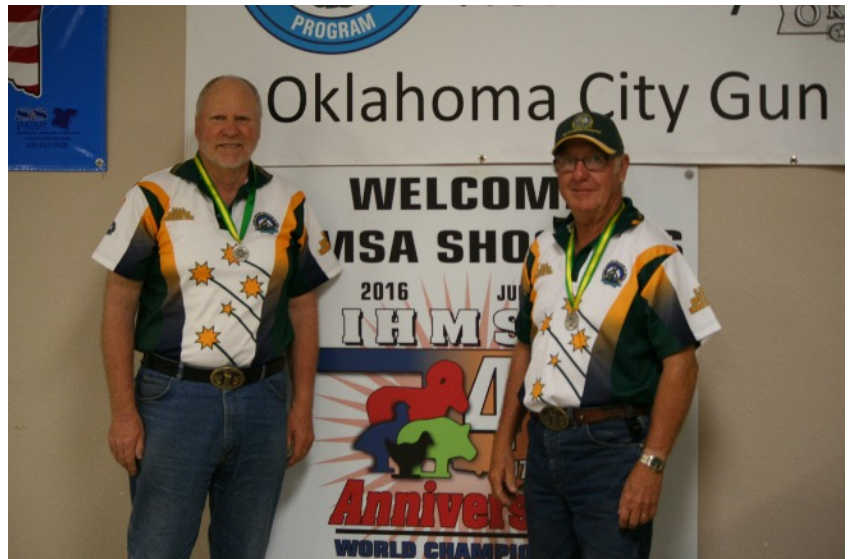
Australia, second Place