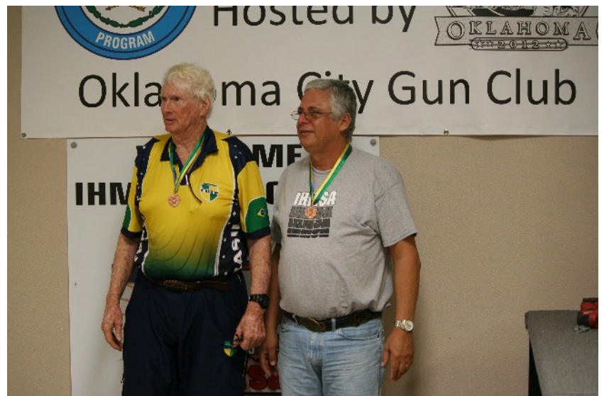
Brazil, Third Place