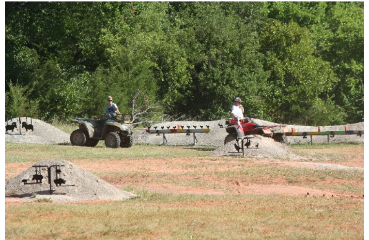
Cannot forget the target setters!