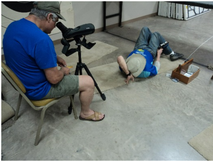
Air Pistol Match