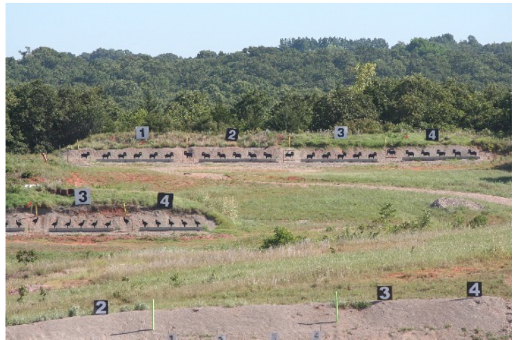
500 Meter Rams