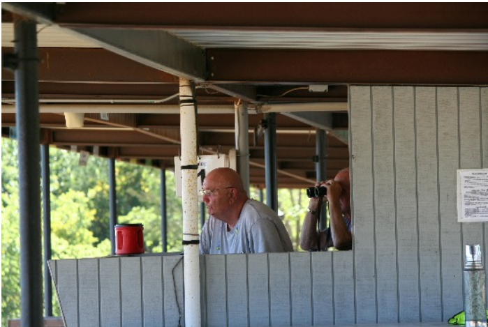
Range Masters hard at work