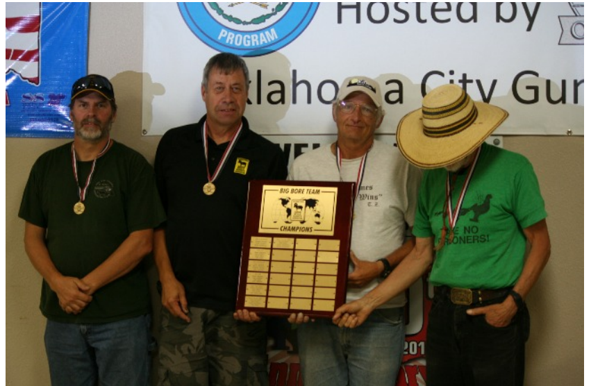
USA, Winner of the team award